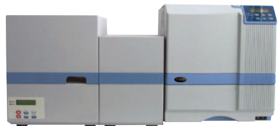
Prima with in-line lamination unit

North American Sales & Support Centre 6711 - 176th Avenue NE, Redmond WA 98052 Toll Free: 877 236 0933 Tel: (425) 556 9708 Fax: (425) 556 3962 email: USsales@UltraMagiCard.com